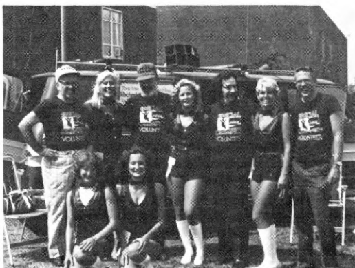
K2JD Volunteers at 1979 International Special Olympics hard at work with the Buffalo Bills Cheerleaders.

August 8 saw the beginning of the Special Olympics at Brockport, NY. This event ran from August 8 to 13. There will be more on this in the next issue of the Rag.