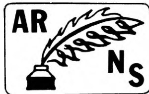
Amateur Radio News Service

authority extended it to currents of all frequencies, including DC. A June issue of another popular national magazine, in response to a reader's question, said, "Yes, it is advisable to unplug your electric toaster when not in use because current flows through the wires to the power switch on the appliance even when it is not in use." That writer must get awfully tired going around pulling the plugs on lamps, TV's, microwaves, electric stoves, etc., because if his rule applies to toasters, it must be true of everything else! . . .