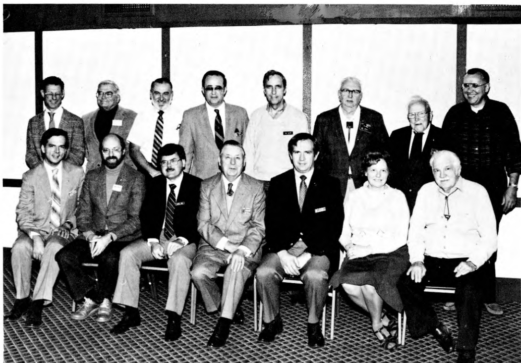
ATLANTIC DIVISION STAFF MEETING

be heard at League Headquarters. I will also remind you that RaRa was one of the first clubs in the country to apply for and be approved as a Special Service Club (SSC). This is an indication of our commitment to the Future of Amateur Radio.