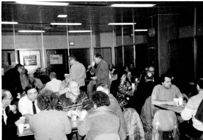
REFRESHMENTS AFTER THE KODAK PARK MEETING