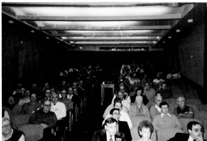
DECEMBER RaRa MEETING AT KODAK PARK