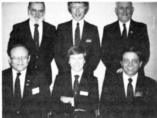
Back row: N2EH, K2UW, WA2UGE. Front row: K2MP, KA2J, WA2CER. Missing: WB2UTI

Pictured below are those that attended the latest meeting held in Vestal, NY on Saturday, April 5, 1986.