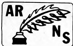
Amateur Radio News Service

Full permission is granted for reprinting articles provided a credit line is given to the RaRa RAG. The RAG exchanges with other organizations' publications.