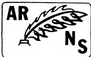
Amateur Radio News Service

Full permission is granted for reprinting articles provided a credit line is given to the RaRa Rag. The Rag exchanges with other organizations' publications.