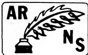
Amateur Radio News Service

Full permission is granted for reprinting articles provided a credit line is given to the RaRa Rag. The Rag exchanges with other organizations' publications.