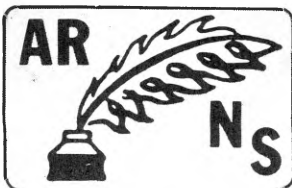
Amateur Radio News Service

Full permission is granted for reprinting articles provided a credit line is given to the RaRa Rag. The Rag exchanges with other organizations' publications.