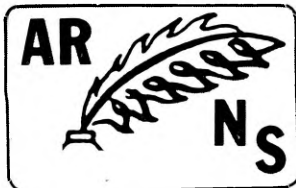
Amateur Radio News Service

Full permission is granted for reprinting articles provided a credit line is given to the RaRa Rag. The Rag exchanges with other organizations' publications.