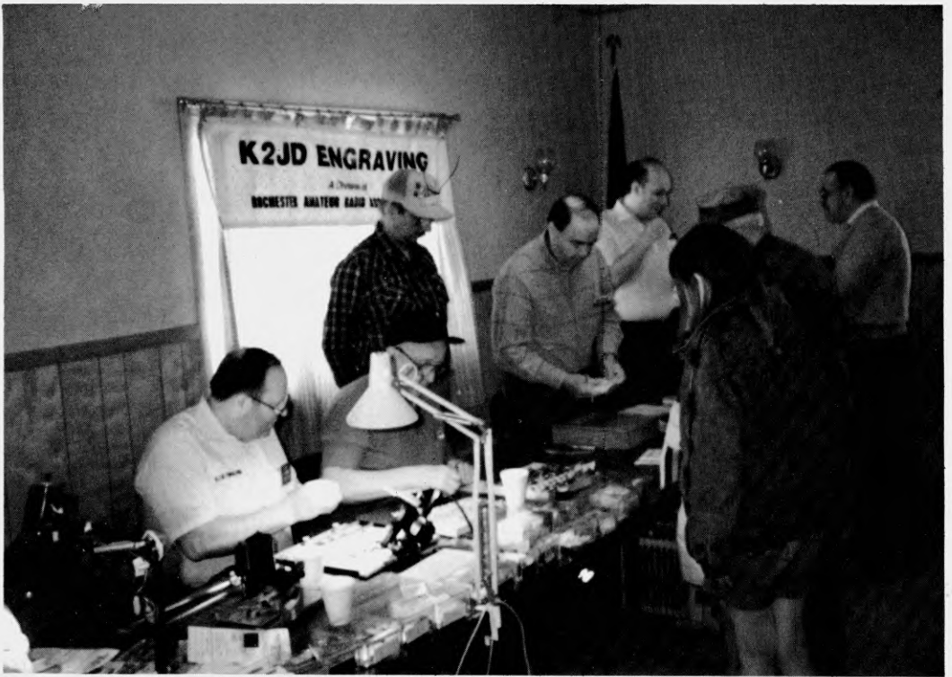
K2JD engraving team at the Newark Hamfest was made up of many RaRa members.