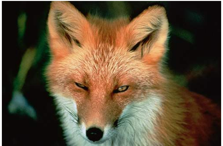
"Catch me if you can"